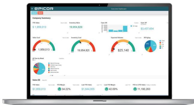
Epicor Data Analytics—example of an Executive Dashboard

EDA is a comprehensive end-to-end service delivered and supported by Epicor. It is fully integrated with Epicor ERP, using your data to provide a broad