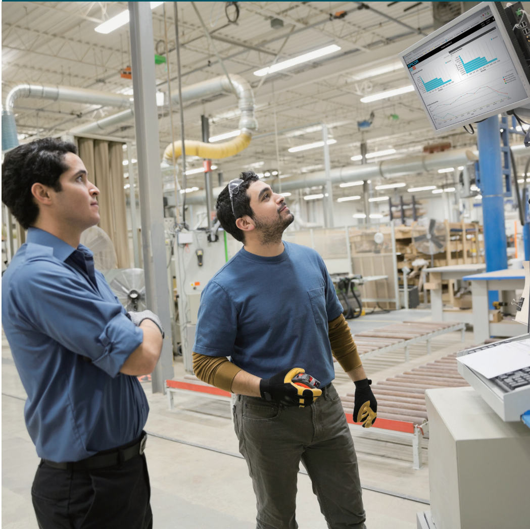
Public Internal Dashboards production floor use example